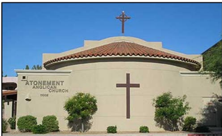
Atonement Anglican Church, Fountain Hills, AZ