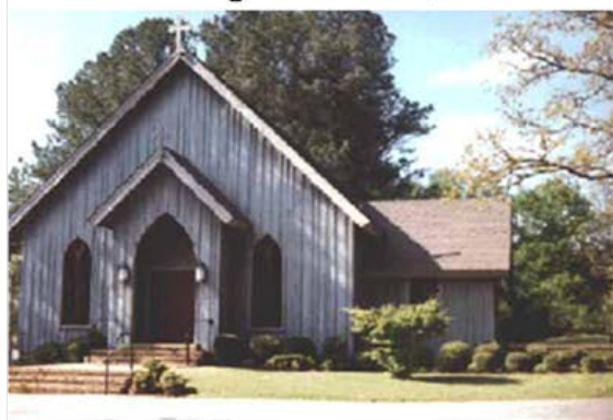
Church of the Holy Cross, Oklahoma City, OK