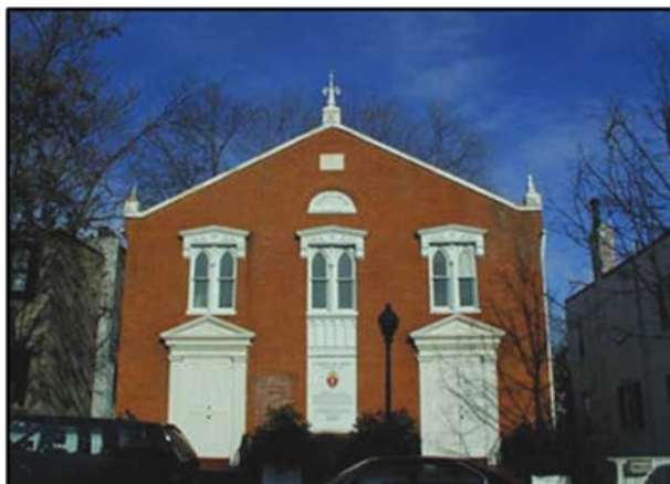
Parish of Christ the King, Washington, D.C.