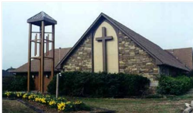
Church of the Holy Comforter, Montevallo, AL